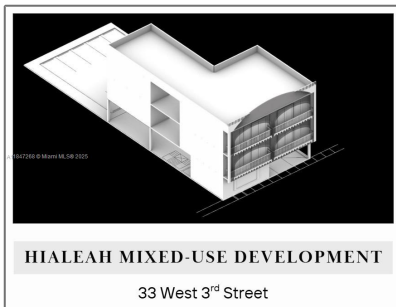
HIALEAH MIXED-USE DEVELOPMENT