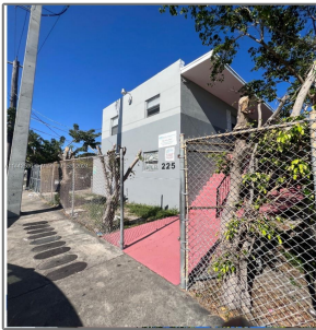
South Elevation , Street